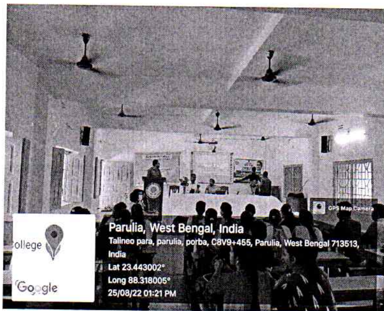
Fig. Programme on "Career Talk" on 25.08.2022